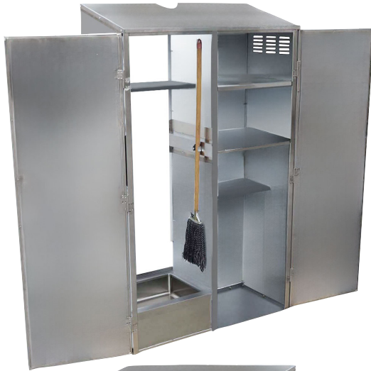
48231 Left Mop Sink