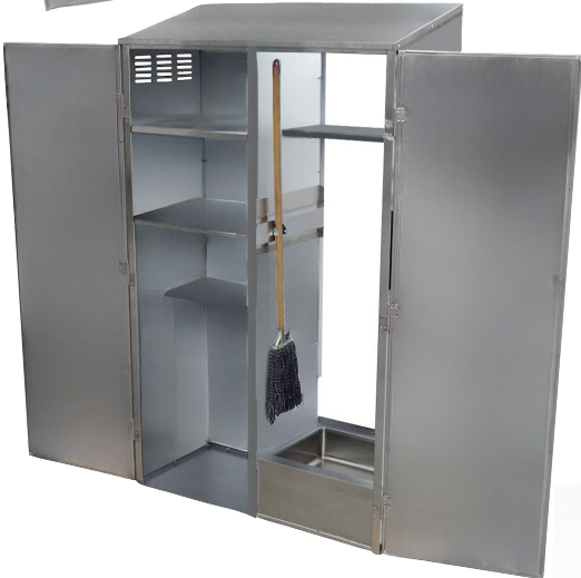
48232 Right Mop Sink