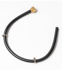
Service Faucet Hose

This 2-door janitorial cabinet provides versatile and reliable storage.